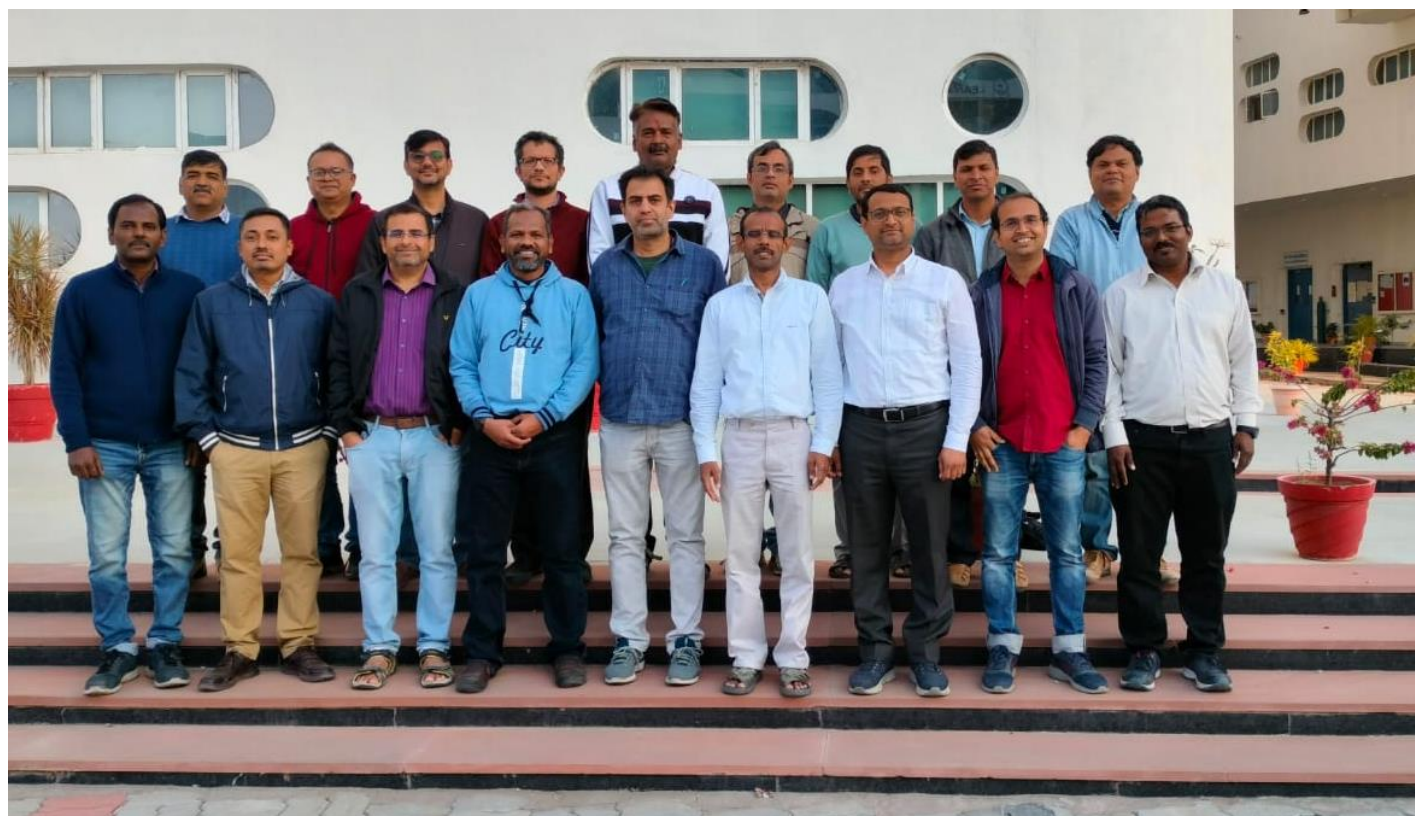
Faculty at Department of Chemistry, IIT Indore

Applicants are strongly advised to visit the profiles of all the #faculty members ( https://chemistry.iiti.ac.in/people/faculty/ ) before applying for the Ph.D. program and are also encouraged to contact the interested faculty members to gain more information.